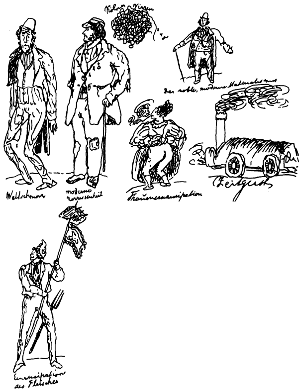
4. Cartoons by Engels, June 1839 ( top left to right ): World-weariness; Modern Stress and Strain; ( above ) Discord of Cologne; ( top right ) the Noble Modern Materialism; ( below ) Emancipation of Women; Spirit of the Times; Emancipation of the Flesh