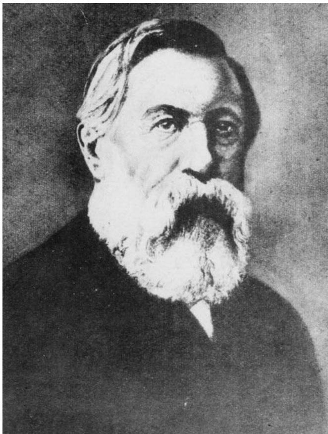
8. Friedrich Engels, c.1895 (the year of his death)