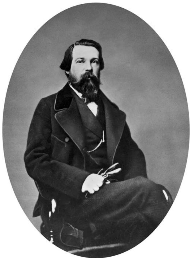
7. Friedrich Engels in mid-life