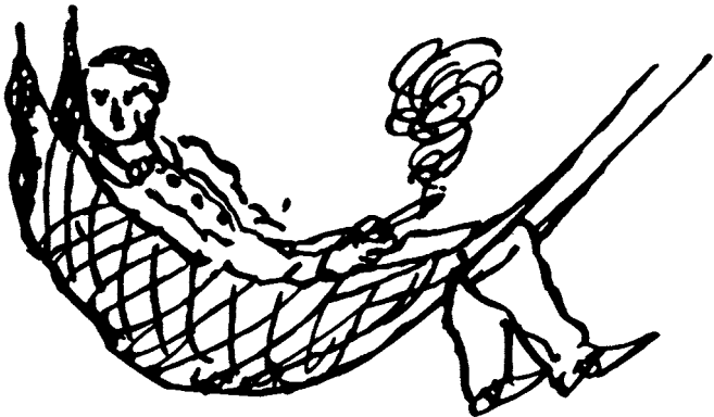
3. Engels's caricature of himself, August 1840: 'My hammock containing myself smoking a cigar'