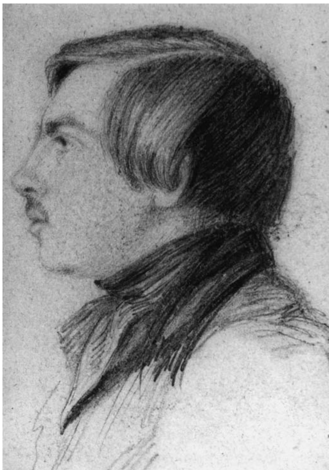
2. Friedrich Engels at 19